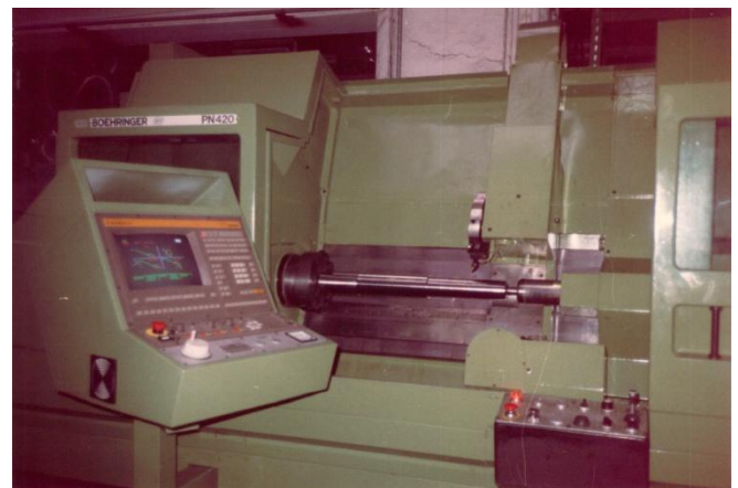
Figure 3: At least 10 Boehringer rebuilt the WIAP AG. This resulted in a strong bond between the WIAP and Böhringer construction; respectively. Machine design of Messrs. Bohringer.