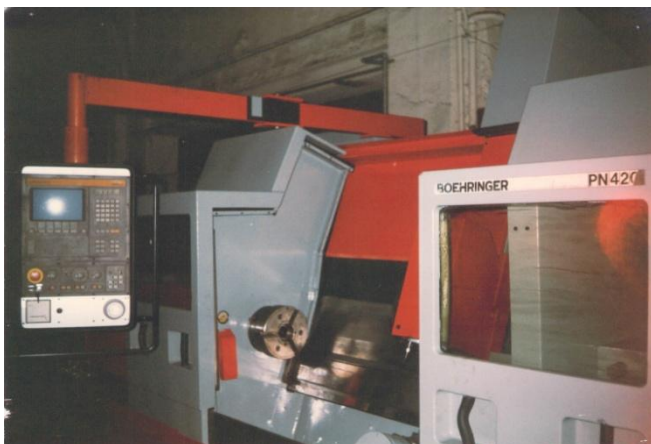
Figure 1: Boehringer PN 420 rebuilt with a new Sinumerik CNC control

The WIAP AG has revised several Boehringer CNC machines and rebuilt. Boehringer was a company such as Georg Fischer, a leader in Europe. Boehringer, which has worked in previous years Turcye sliding surfaces and this triggered on many machines had a considerable amount of equipment to be improved worldwide. This took a lot of strength to the prestigious lathe manufacturer. But what they built, no matter what gear, or whatever, Böhringen was a remarkable, good mechanical engineer from Germany. If the WIAP AG rebuilt a 30-year-old machine, so customers have produced another 20 to 30 years hence.