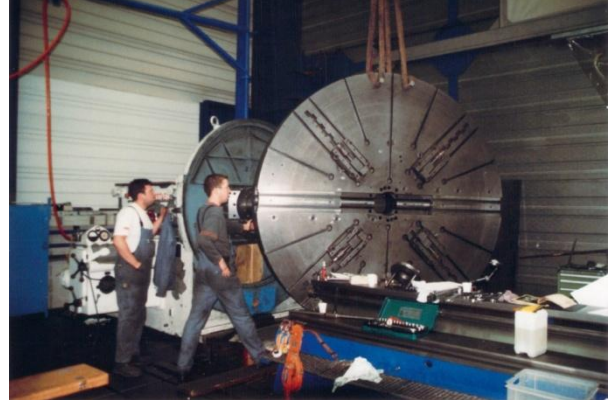
Figure 2: It takes a delicate handling by crane when a face plate must be removed from the spindle nose like that.

Photo report: Repair of headstock crack at Heiligenstaedt by WIAP AG