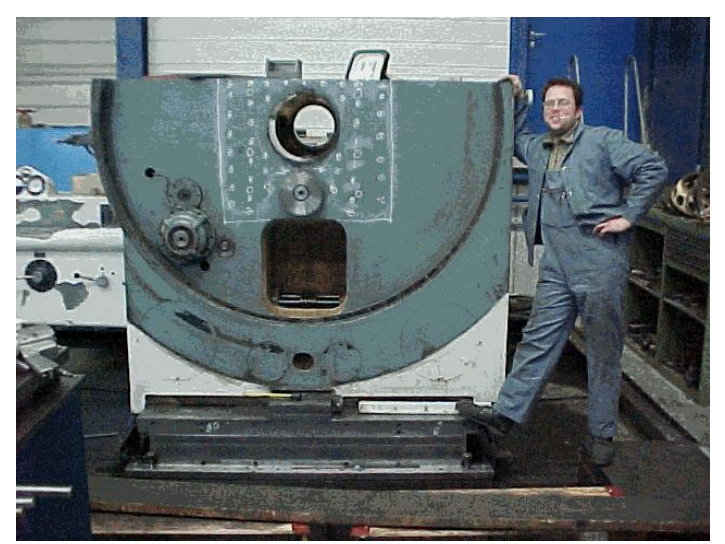
Figure 4: Here we have marked out as we attach a new front panel. The headstock had split a crack across. With the large front panel we have prevented the further spreading. On a boring everything had to be milled clean and many large threads were needed to enable the pressing force coincides with the friction to continue loading large workpieces.