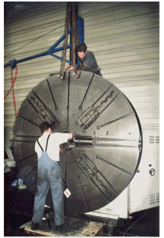
Figure 1: First, it is always dismantle these faceplates.

The customer had clamped too big a workpiece on the machine. This has torn the headstock. Measures of WIAP: Spindle dismantled. Headstock casting repaired. New spindle bearing made., The proven NN storage in the existing main spindle bearings installed in place. This with a two-part box, so it was mounted. Construction, dismantling and installation of WIAP AG. Processing the customer. Of execution of the project: in Switzerland.