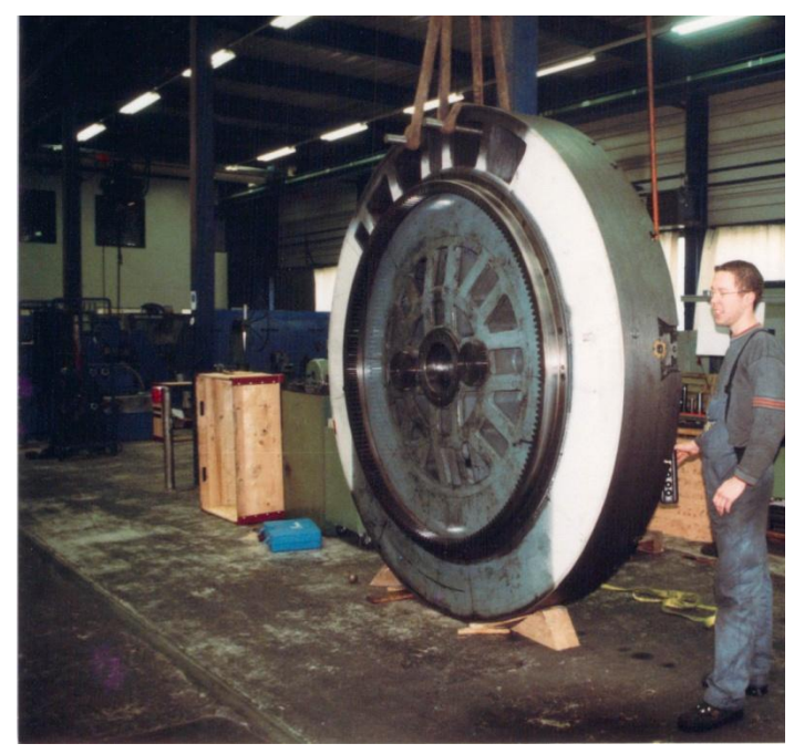
Figure 3: faceplates dismantling